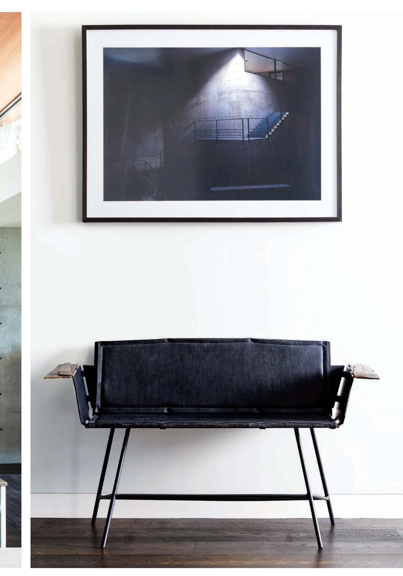
Complementary Composition (ABOVE) A framed photograph of a Tadao Ando structure taken by the homeowner graces the home's entryway above the Inflecto settee by Chuck Moffit from De Sousa Hughes. Industrial Impact (LEFT) In the kitchen, a smooth-finish concrete wall, inspired by Ando, boasts reclaimed oak shelves. The countertops are brushed stainless steel. See Resources .

"THIS PROJECT IS A CASE STUDY IN HOW THE SPACES WE INHABIT WEAVE TOGETHER WITH THE SPACES THAT NATURE HAS ALREADY CREATED"